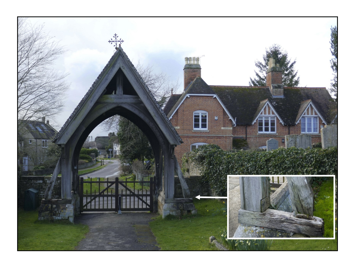
The lychgate showing an example of the rotting wood.

However, being an optimistic bunch and having great expectations of our members' fund raising (and successful grant applications) we press on. We will keep you informed.